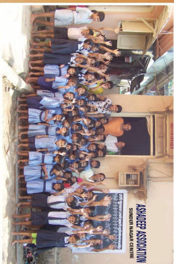
SUNDER NAGAR CENTRE