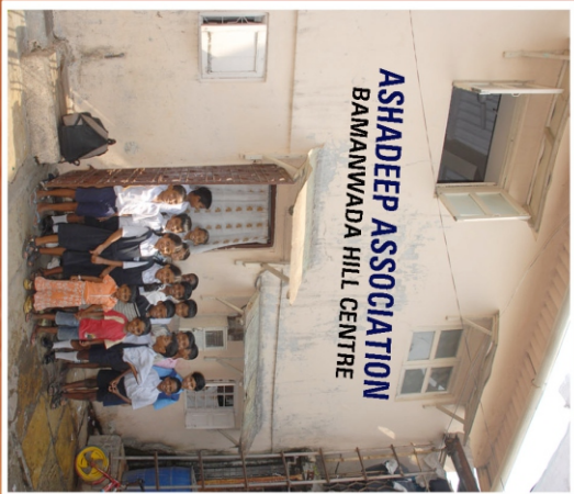
BAMANWADA HILL CENTRE